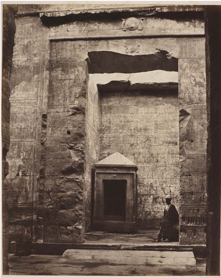
Francis Bedford (1815-94). Monolithic shrine in the Adytum of the Temple of Edfou [Temple of Horus], 14 March 1862, Albumen print, 289 x 233mm