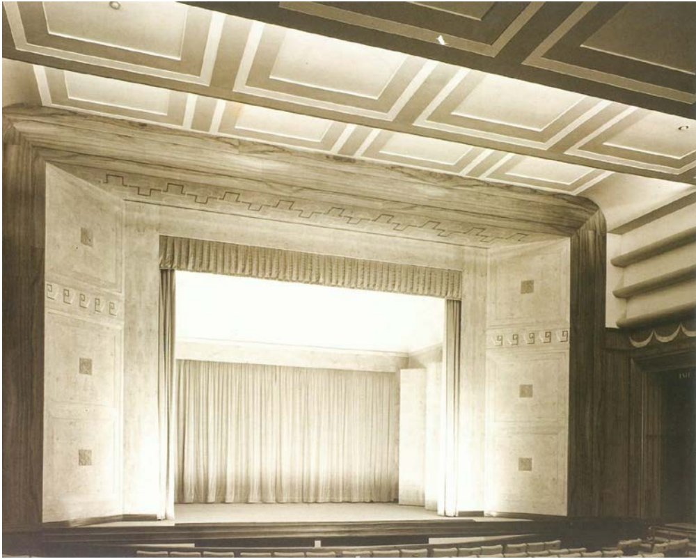
Archive photograph of the Barber's concert hall. The Barber Institute of Fine Arts, University of Birmingham.